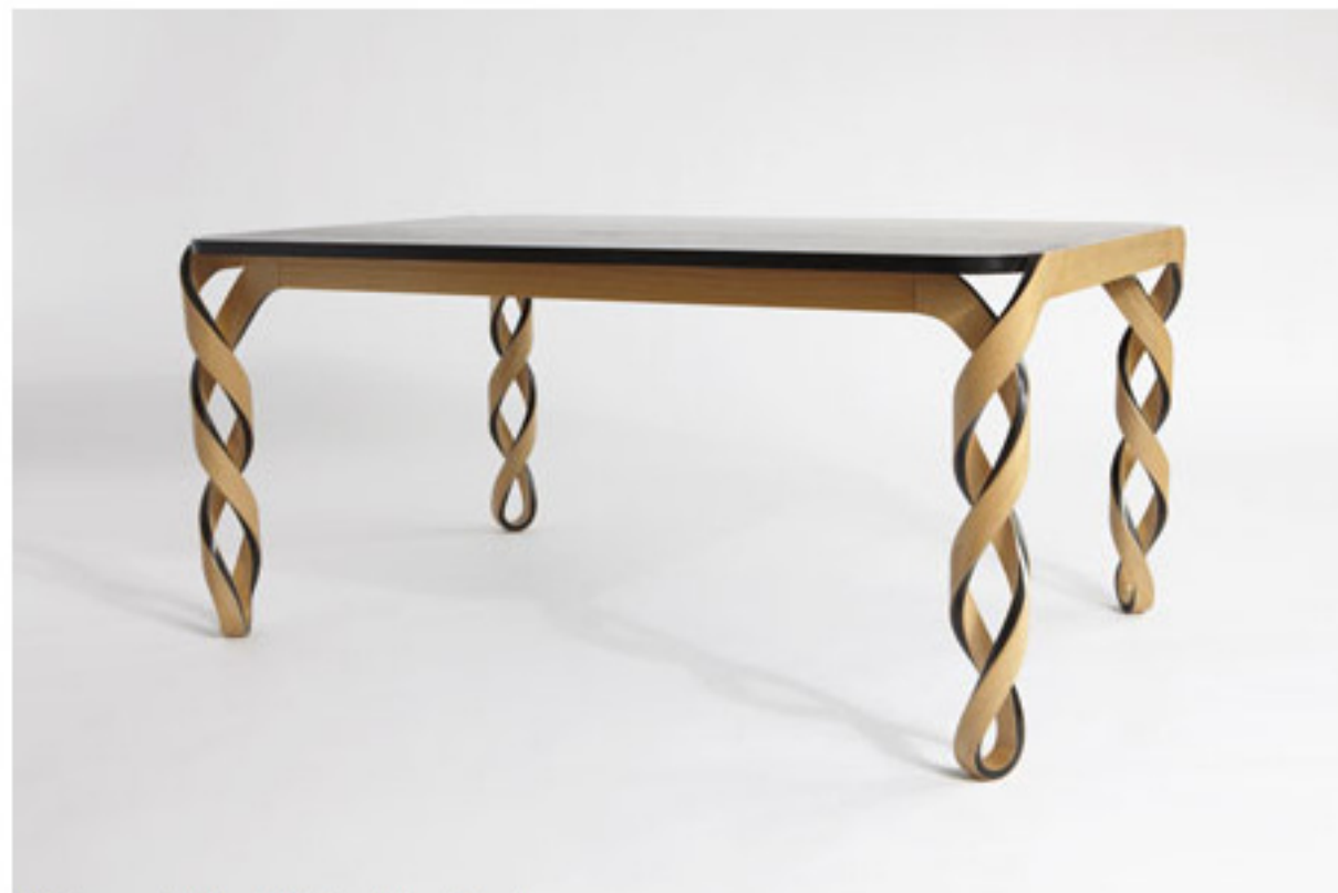
Watson table di Paul Loebach

The Centina totem by Oeuffice is a monolithic object that reveals in a smaller scale the aesthetic fascination of concrete bearing structures in architecture. Its simplicity, elegance and repetition gives this object a special character and a sense of importance within the domestic landscape. Last is Yachiyo metal rug made using a very intricate form of chain mail. It is drawn from the Japanese 12-in-2 chain mail method to create a very stable membrane – structural yet flexible – not dissimilar to a tight hand-tufted rug.