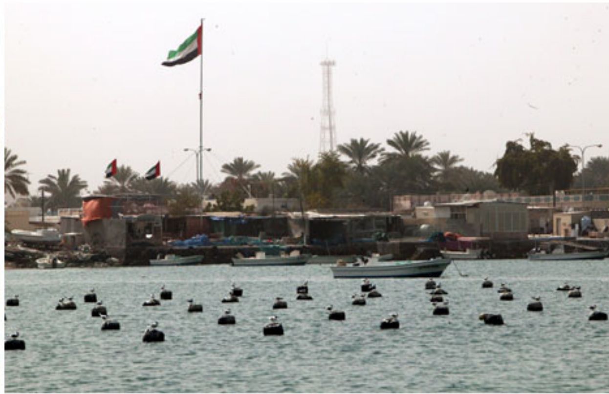
Illusion Pearl @Carwan Gallery

Khalid Shafar took inspiration from today's Dubai; the dramatic city highways at night, to design a work featuring a rope weaving over walnut timber frames to produce a chair set with over 9000 cultured pearls, locally produced by the Emirati Company RAK Pearls. Goat-hair armrests add a textural element.