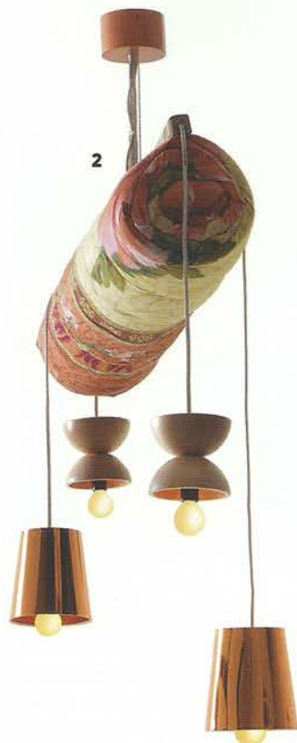
1 ARABI Lamp by Khalid Shafar 2 T Chandelier 3 Talli rug collaboration between Khalid Shafar and Tai Ping 4 The Egaal worn by men in the region inspired the ARABI collection 5 ARABI space divider