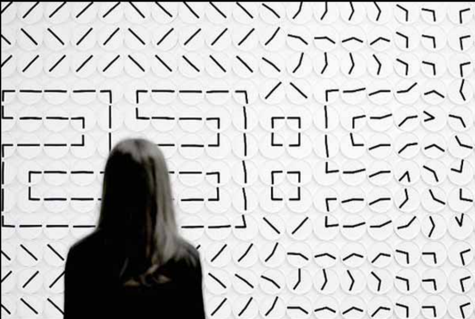
A Million Times (Time Dubai) - Humans Since 1982

This year the fair comprised 29 exhibiting galleries from around the world, including Australia, South Africa, Mexico, Taiwan, Korea, and Europe. The event also saw a 100% increase in the number of galleries from the Middle East – including participants from Dubai, Kuwait, and Beirut.