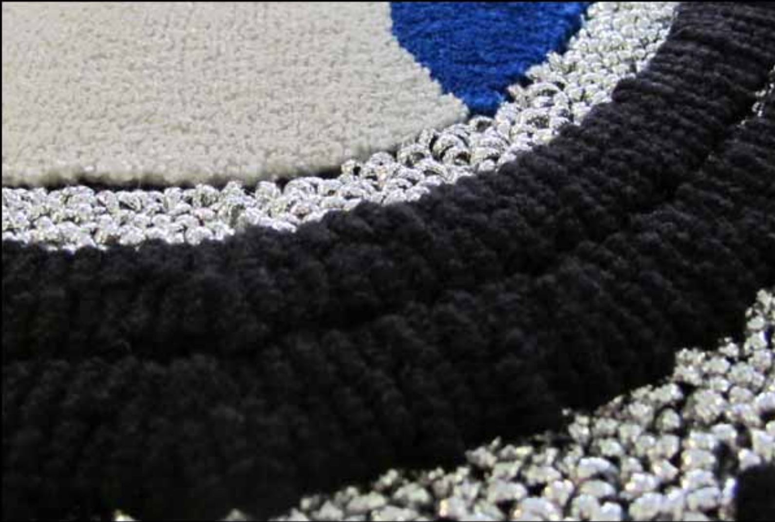
Tai Ping Carpets