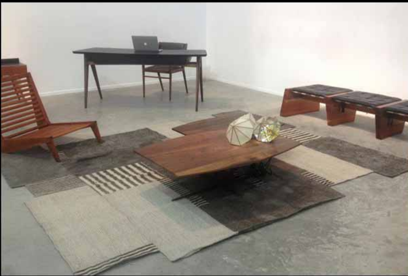
Telharmonium - Fabrica Mexico

Galeria Mexicana de Diseno, a gallery from Mexico City, showcased a collection by Telharmonium for Fabrica Mexico designed specifically for Design Days Dubai. The entire collection sold on the first day of the fair.