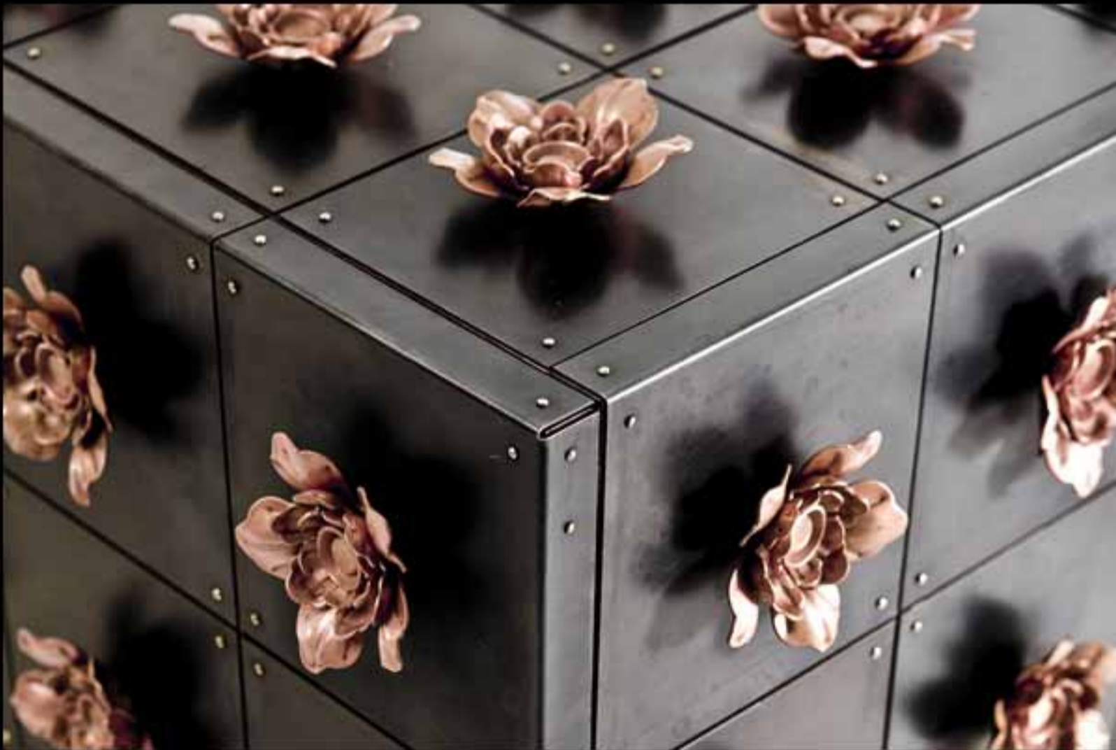
Rosetta Sideboard – Egg Design

Galeria Mexicana de Diseno, a gallery from Mexico City, showcased a collection by Telharmonium for Fabrica Mexico designed specifically for Design Days Dubai. The entire collection sold on the first day of the fair.