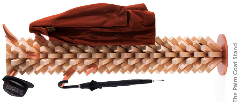
The Palm Coat Stand

Nelson is a small town, simple, urban, hub of design and art, home to theatres, galleries, arts and crafts markets – this environment made me appreciate my heritage and drove me to seek a way to do more to expose it ... the best way I knew was to create design objects ... my ultimate goal is to put Dubai on the design global map one day.