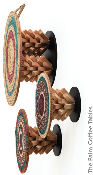
The Palm Coffee Tables

I consider myself a combination of two generations - similar to old Dubai and new Dubai - I see myself as a self-proclaimed-historian that likes to tell stories about my culture through my designs.