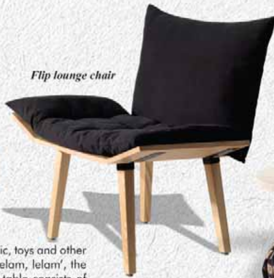
Flip lounge chair