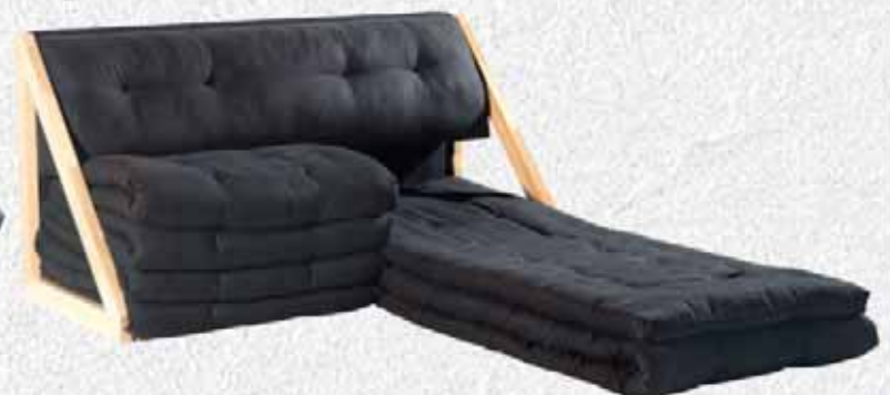
Lazy Fold daybed