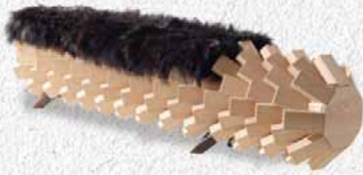
Fallen Palm bench