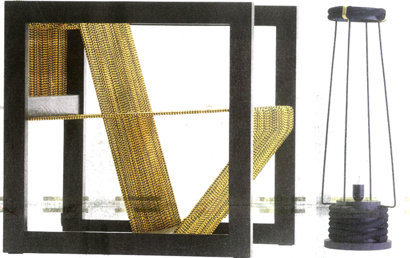
Clockwise from above, Illusion arm chair; Arabi table lamp; The Palm coat stand.