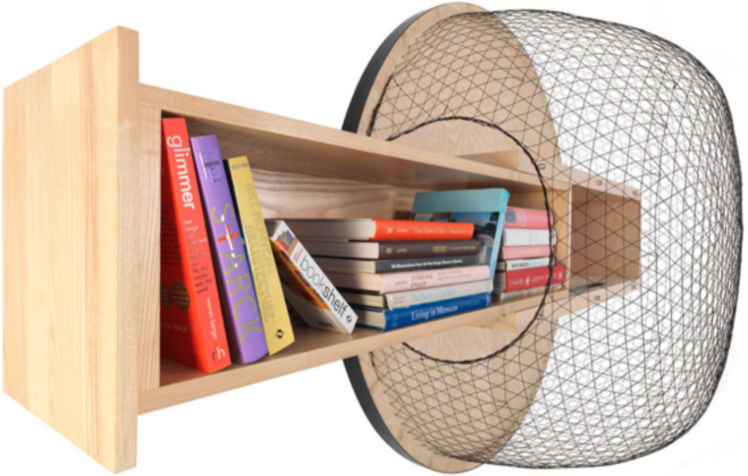
The Trap wall shelf by Khalid Shafar - Limited edition // © Khalid Shafar