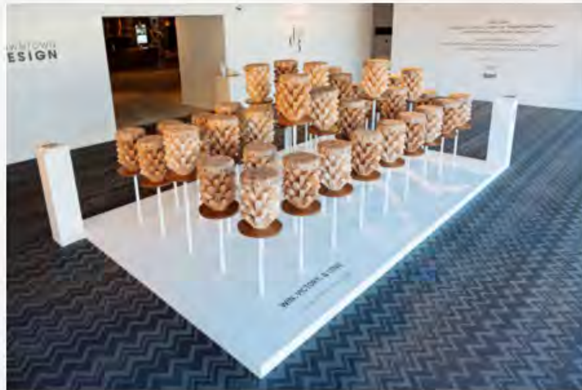
The installation consist of 45 crafted wooden stools in American cherry and soft maple.

"But there is also a direct translation of the message with the use of the upholstery in a camouflage pattern that was taken from the original fabric used for the UAE military uniforms. This was a way of injecting the souls of the soldiers into the work."