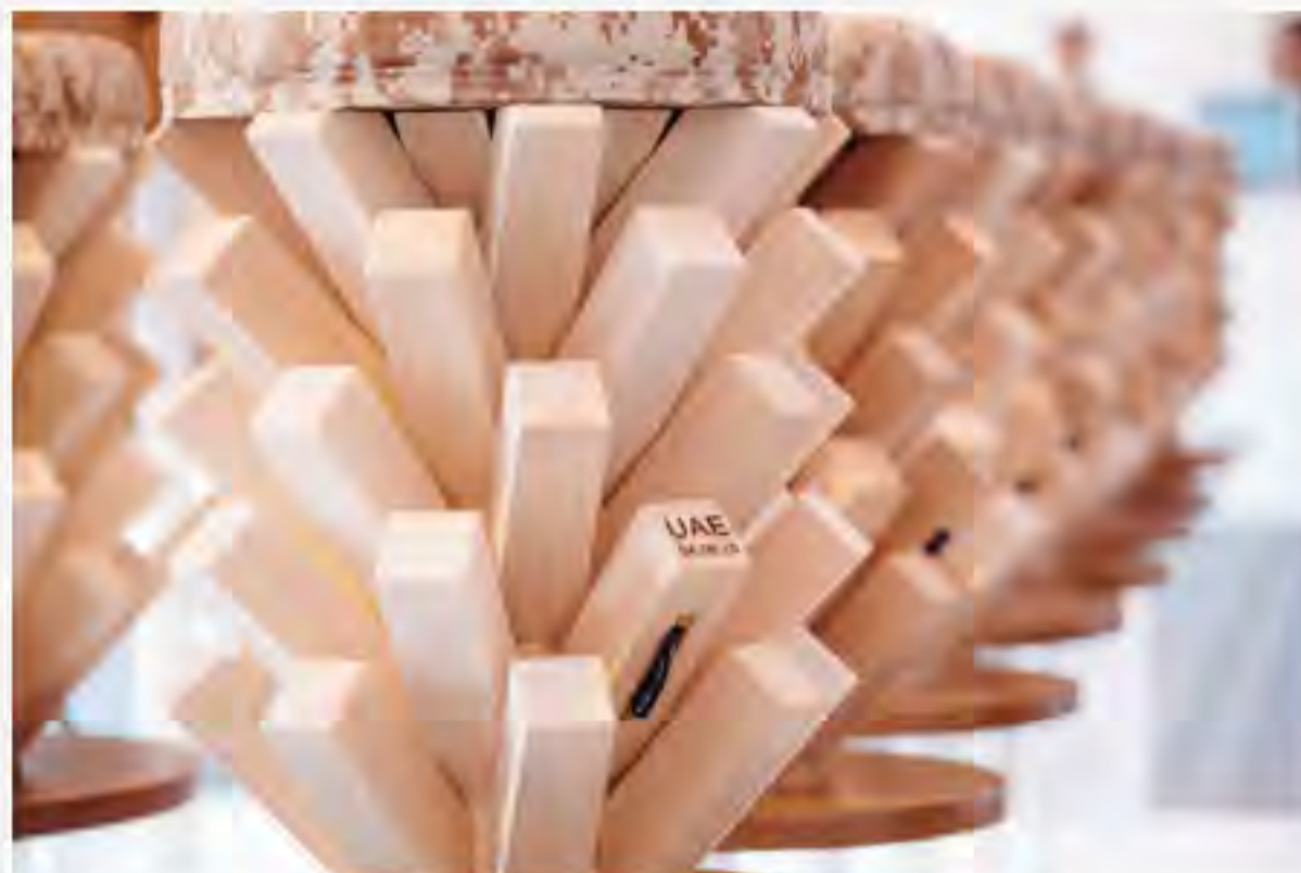
The installation is a homage to the fallen Emirati soldiers.