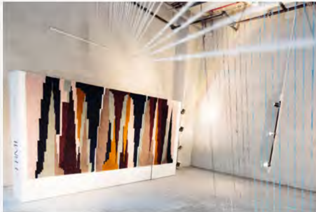
Shafar presented the PUZZLE collection featuring three distinctive editions of handmade wool rugs.

Part of a social initiative, the collaborative project aimed to provide employment to women in Afghanistan as well as healthcare and education.