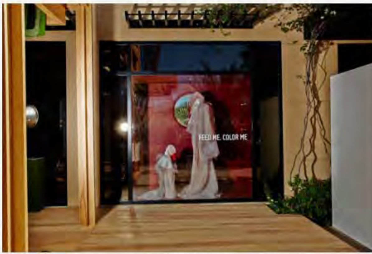
'Feed Me. Colour Me.' project focused on the colouration cycle of the flamingo.