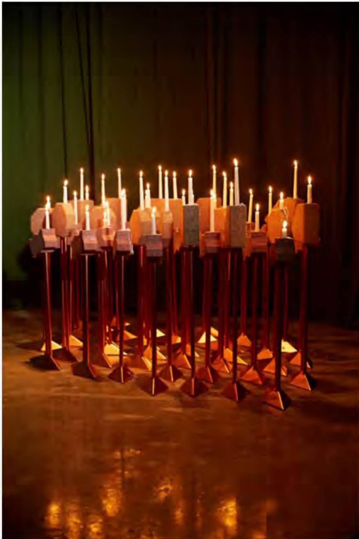
Flame-Ingo candleholder corresponds to various parts of the bird's body.