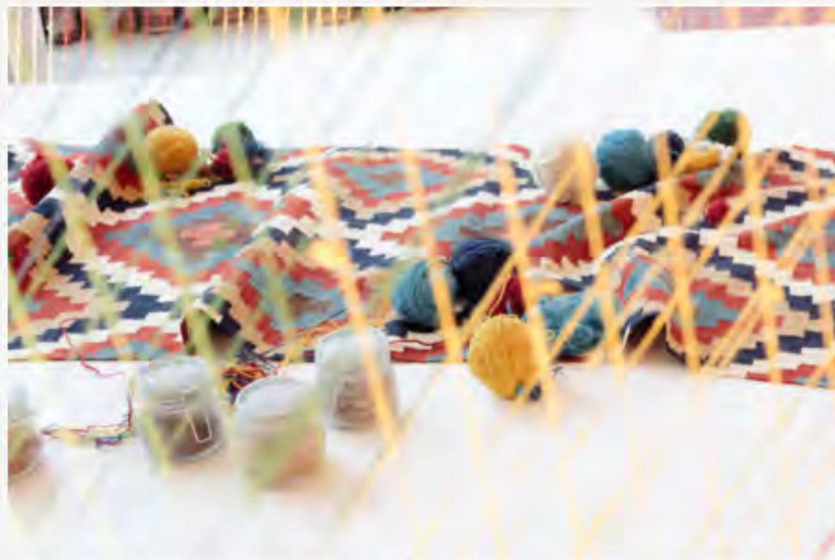
The collaborative project aimed to provide employment to women in Afghanistan.

The Afghani pattern that was chosen is a variation of the Mauri Gul motif that originates from the western province of Herat and is typically woven by nomads. There are many interpretations of the motif but the most widely accepted relates to the return of the nomads to the start point of their travels, hence the circular pattern.