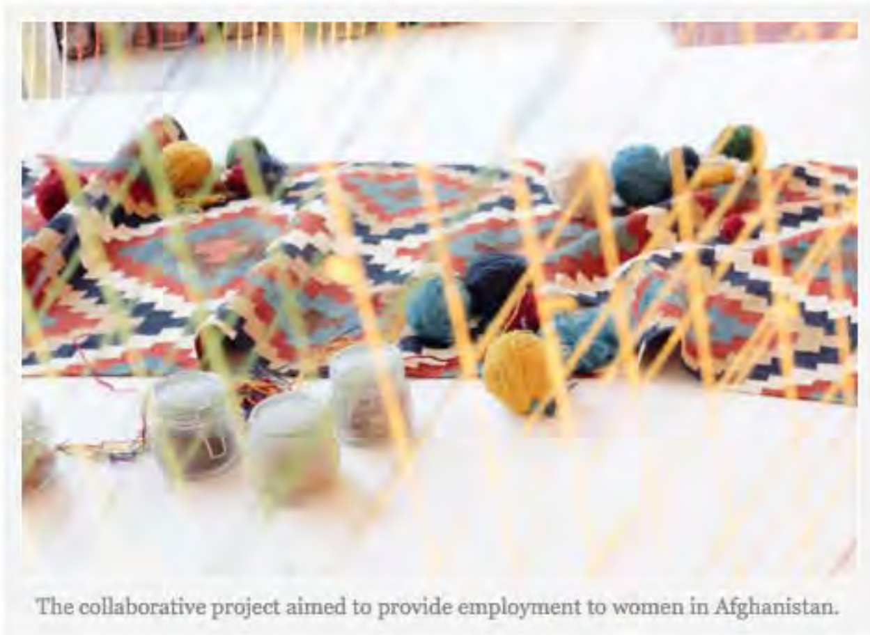
The collaborative project aimed to provide employment to women in Afghanistan.

This collection was first premiered in Milan, Italy during Milan Design Week last April.