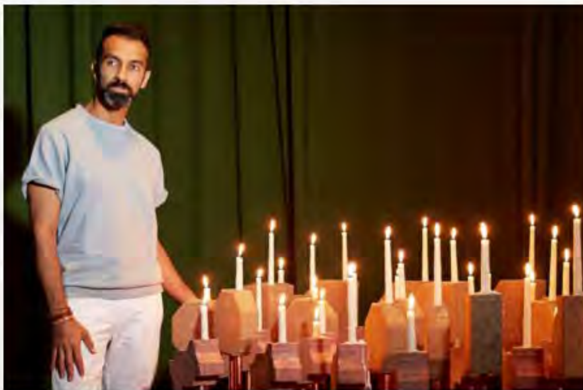
Shafar's main goal is to continue building Dubai's design scene both locally and internationally.

Flame-Ingo explored the relationship between material and form. A mass-produced industrial material, the pavement lock is used to create a candleholder that is once again inspired by the shape of the flamingo. The candleholder's components correspond to various parts of the bird's body such as the tall, slender shape of the candlestick referencing the long neck of the flamingo. As the candle burns and melts over the interlock body, it sculpts a layer of melted wax that suggests its feathers. The grouping of the candles also mimics the mating dance of the birds.