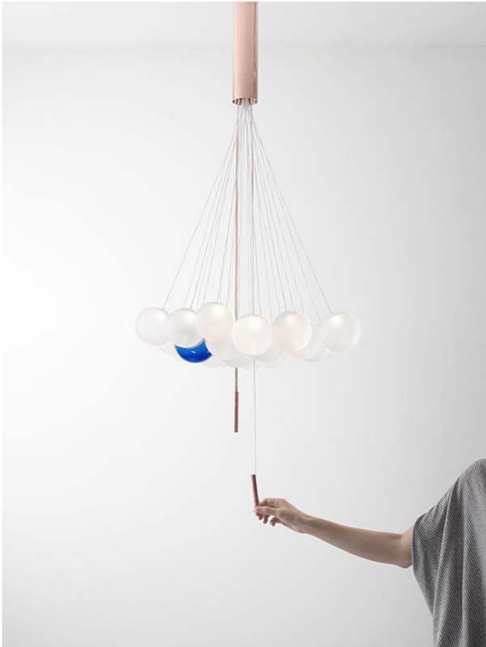
The Random pendant light by Studio.if is designed to create a new experience upon each interaction. Pulling the first string turns on each glass globe, one by one, in random order. Similarly, pulling the second string randomly dims each globe until all lights are off.