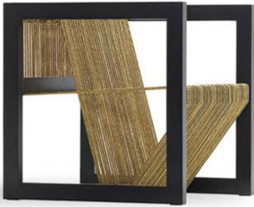
The Illusion Arm chair by Khalid Shafar laces a simple ash wood frame with polyester rope.