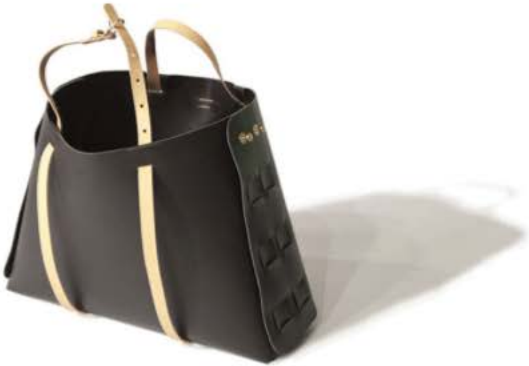
Utilizing uniquely simple methods of construction, French accessories brand, Quinoa Paris produces leather based goods with both luxury and the environment in mind.