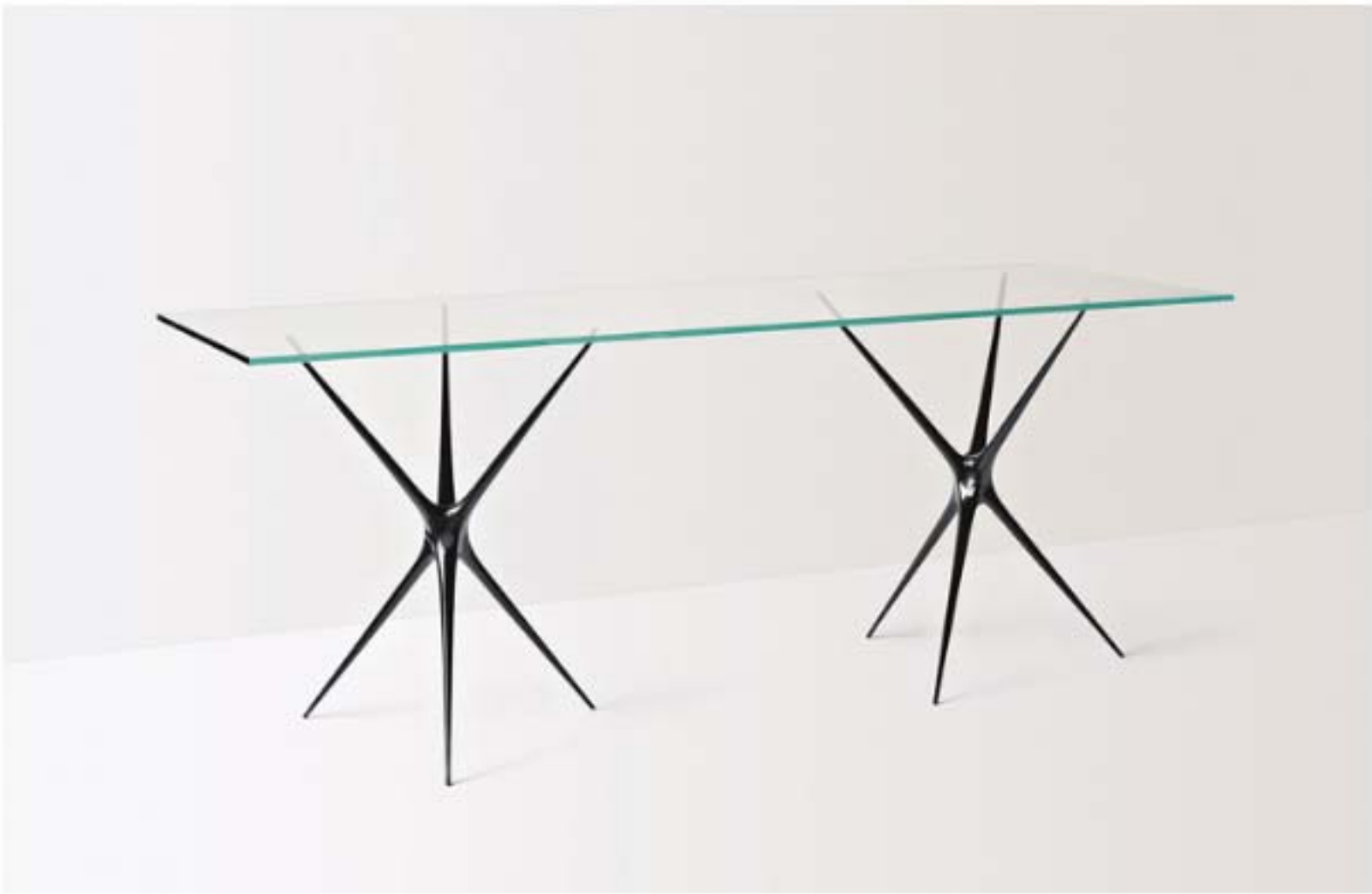
Made in Ratio's sculptural Supernova table. Each tripod base is made entirely from recycled aluminum.