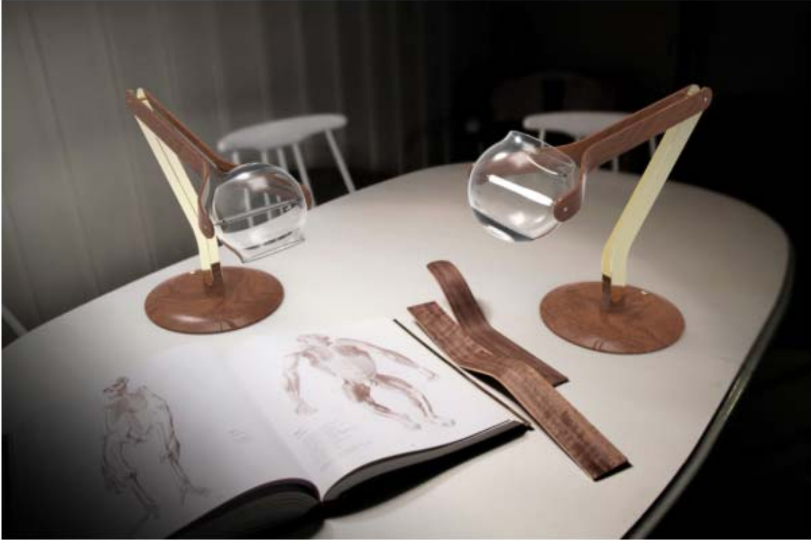
Shown as part of the 100% Norway exhibit, Design Of A Kind's Argus lamp provides two types of light – a warm light for everyday tasks and a more focused light for detailed work.