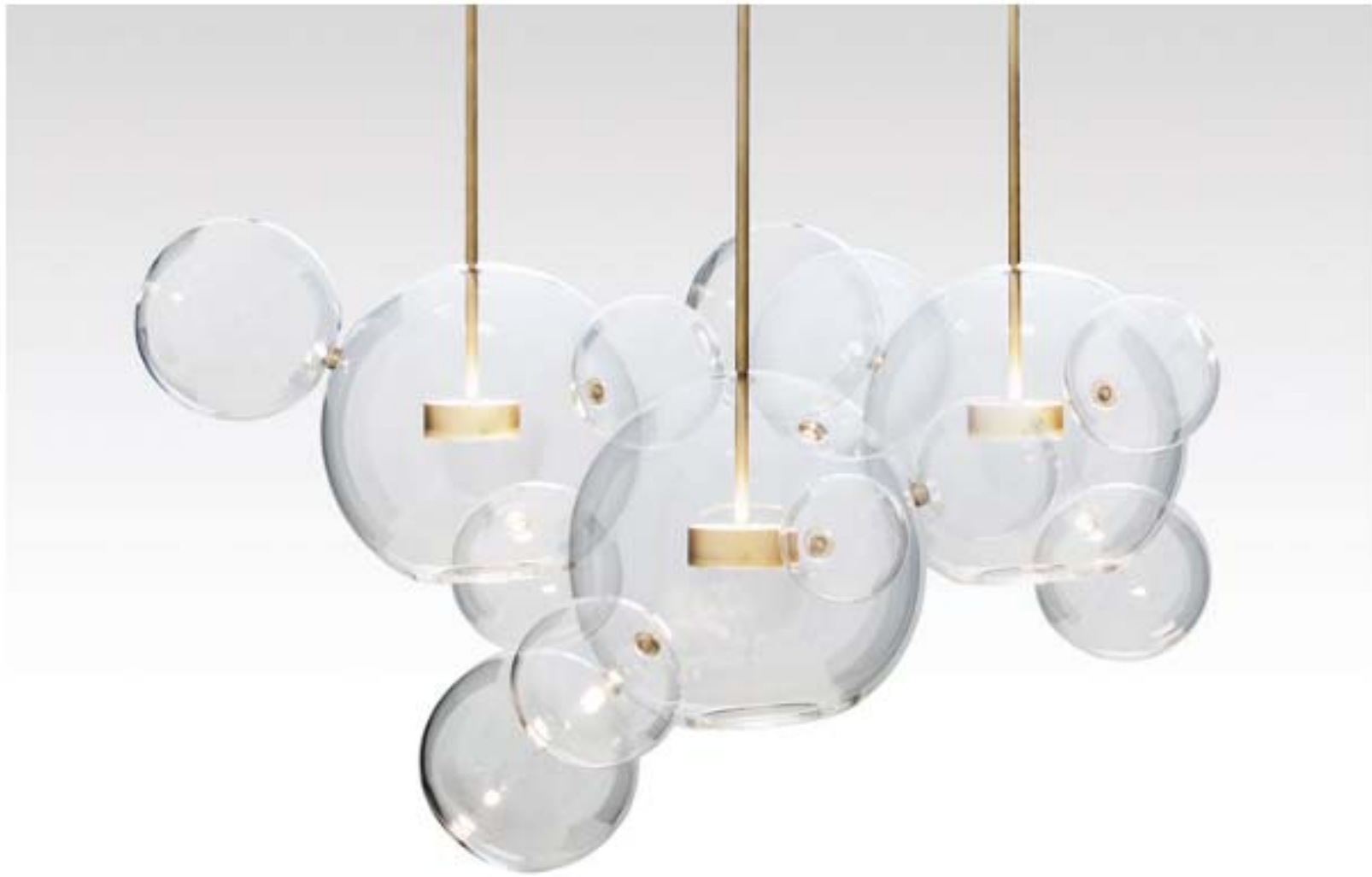
The new Bolle lamp designed by Giopato & Coombes was inspired by the lightness of soap bubbles.