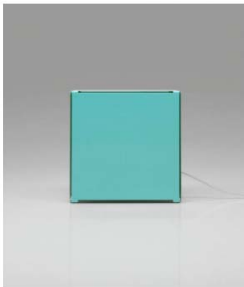
Minimalux debuted several new products, including NEON, a aptly minimal light box partially inspired by the work of artist Dan Flavin.