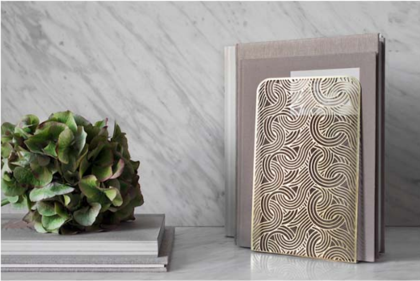
The 400 year old Swedish metalworks brand, Skultuna, collaborated with London based jeweler, Lara Bohinc, to create a series of intricately cut brass bookends and...