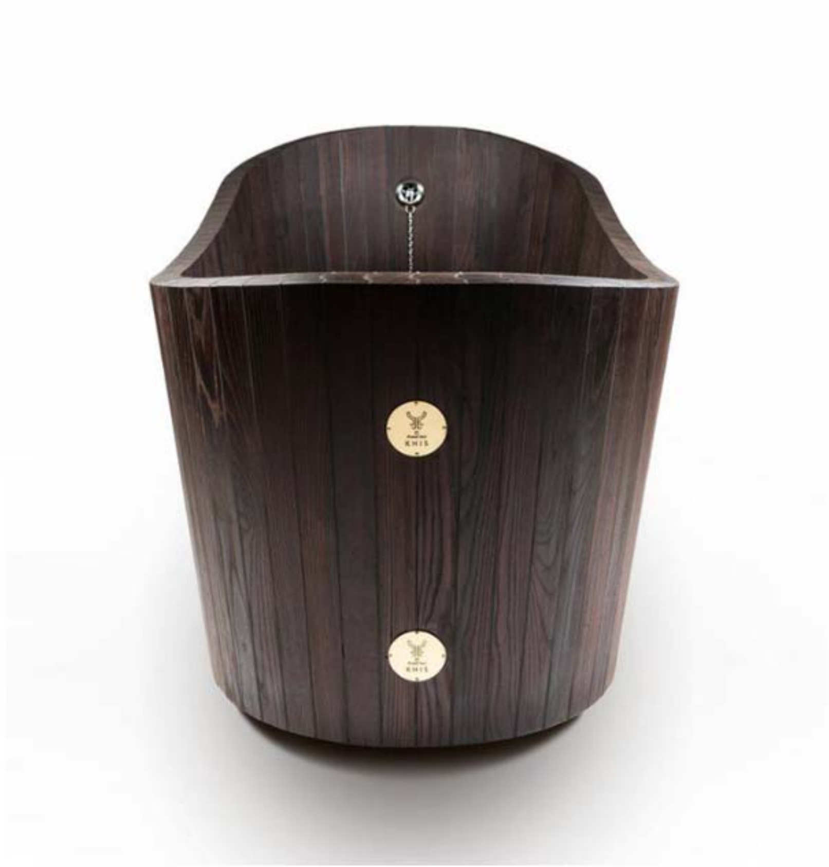
KHIS' hand assembled wooden tubs are made from Nordic ash, bound together with rubber.