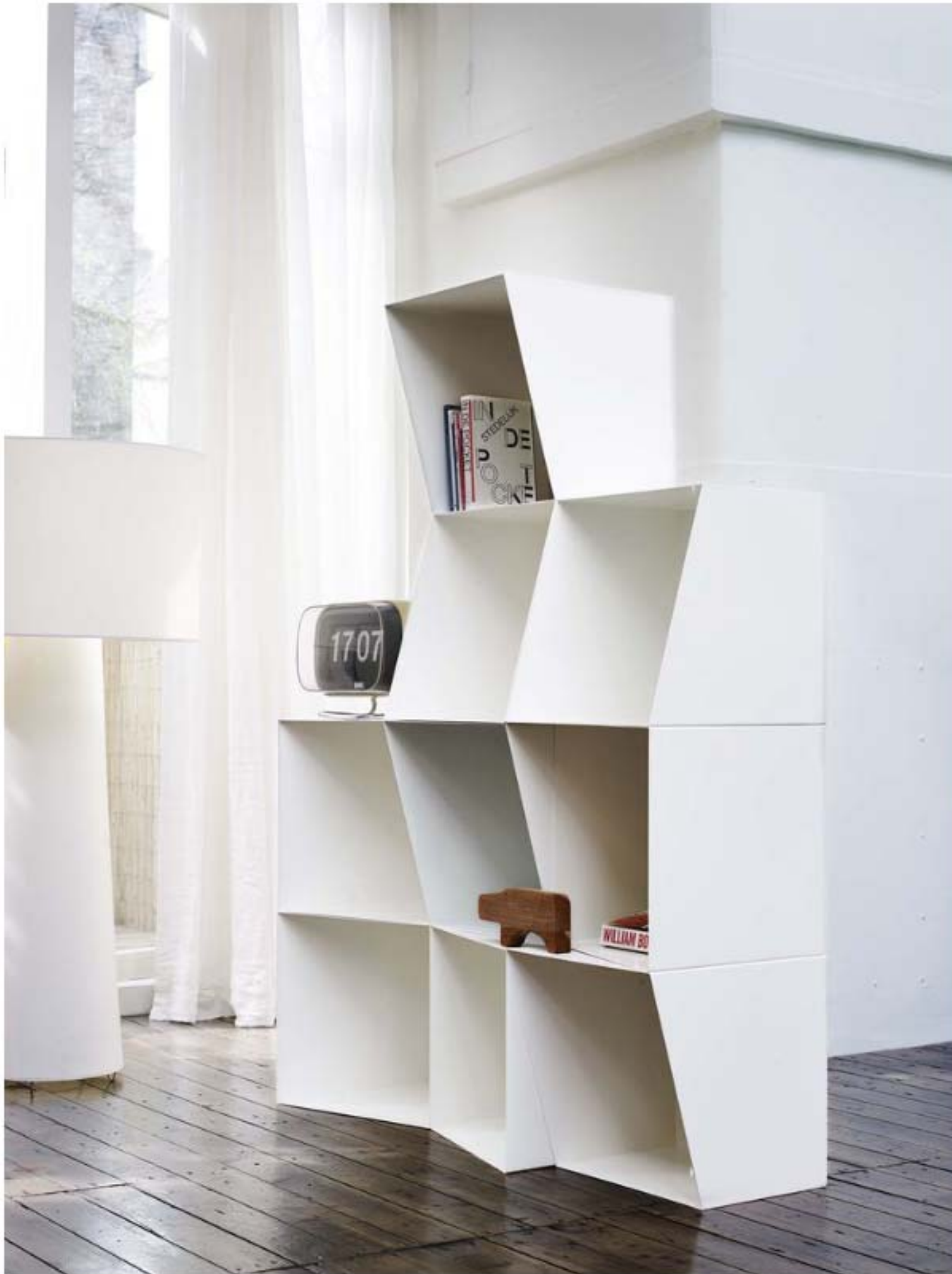
Design by nico's, Totem Bookshelf – a modular system of asymmetrical, powder coated sheet metal boxes handmade by skilled craftsmen in the UK.