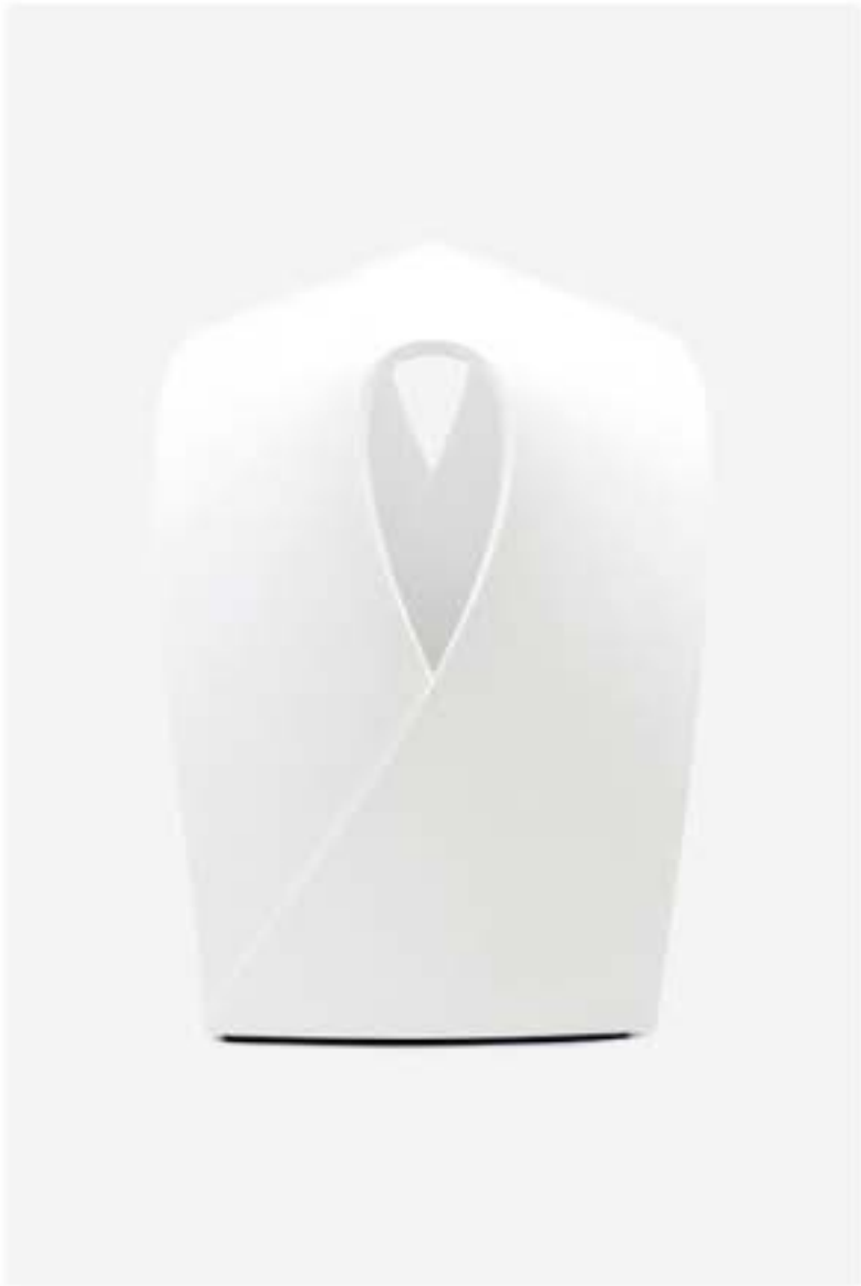
The beautiful new Pleat Bench by Made in Ratio is molded from a single piece of Corian.