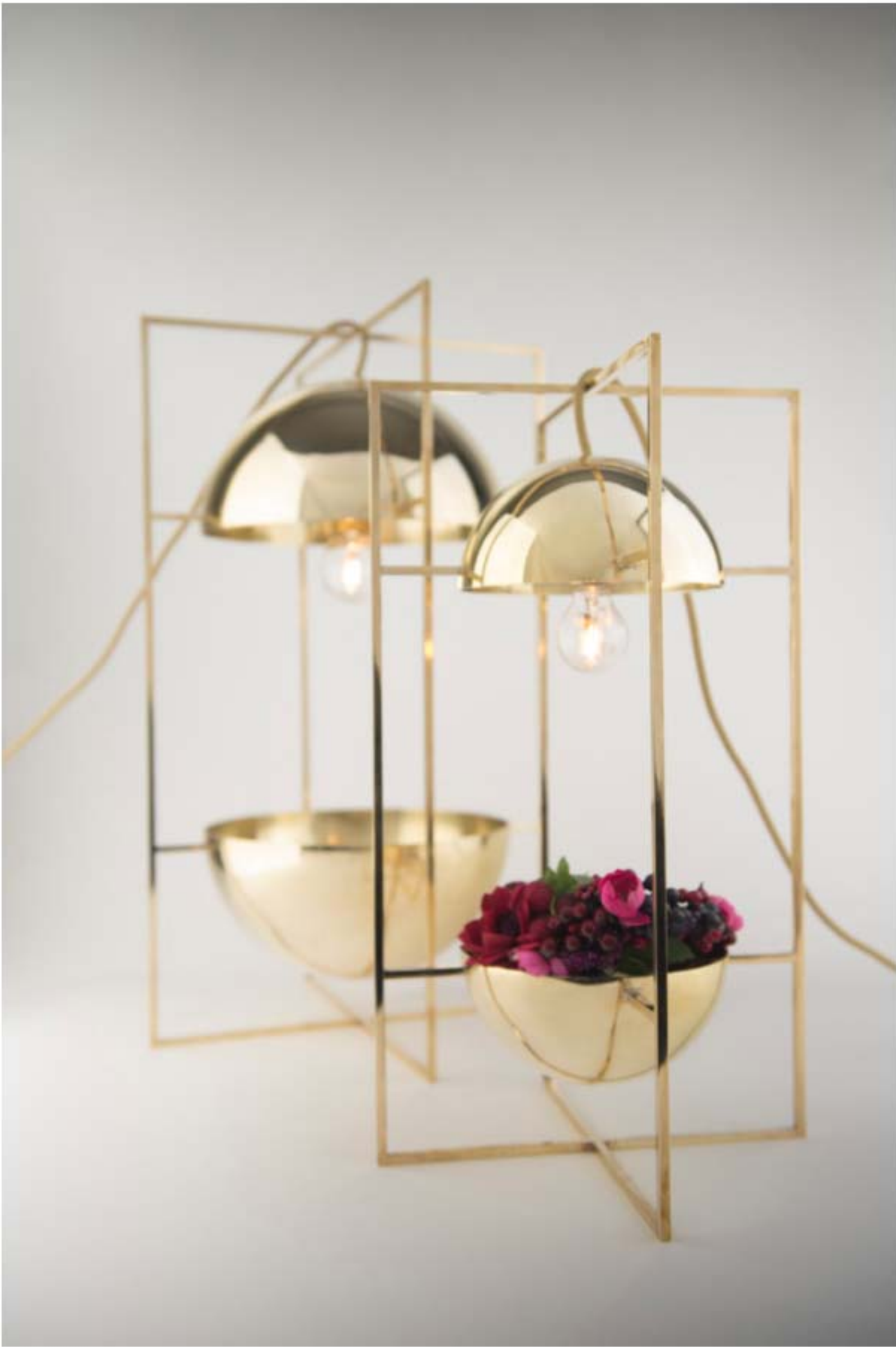
Exhibit Light & Bowl by Slovakia based design studio MEJD provides a Bauhaus inspired display for your precious items.