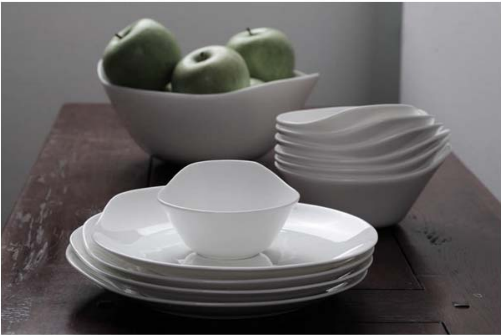
Relax, by Istanbul based designer, Tamer Nakisci, offers a more organic take on standard dishware.